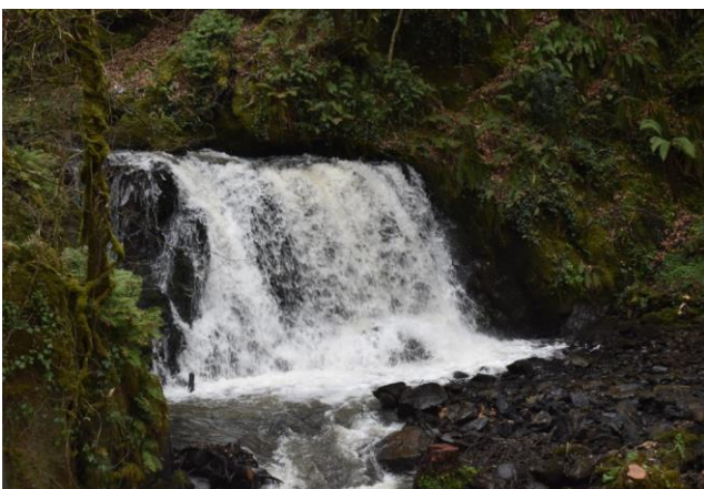
Eden Vale Waterfall